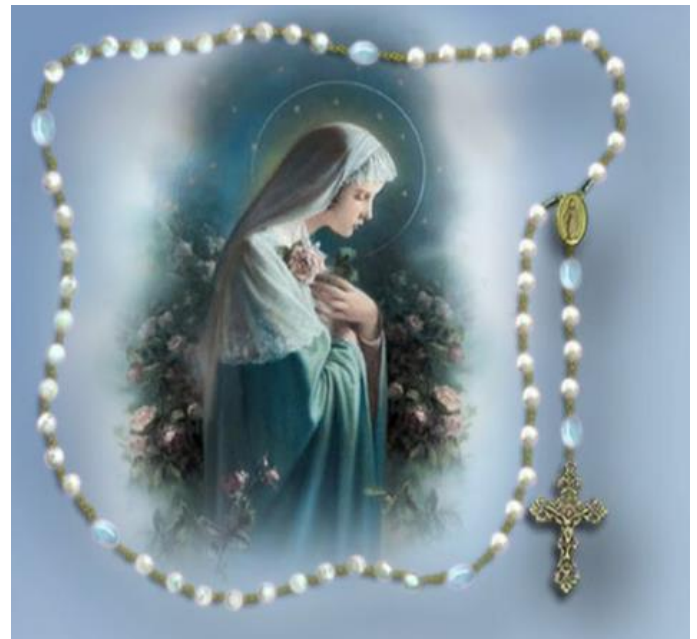
Pray the Rosary

If there is someone you would like the council to pray for, please send me an email and we will add them to our prayer list for brothers to include.