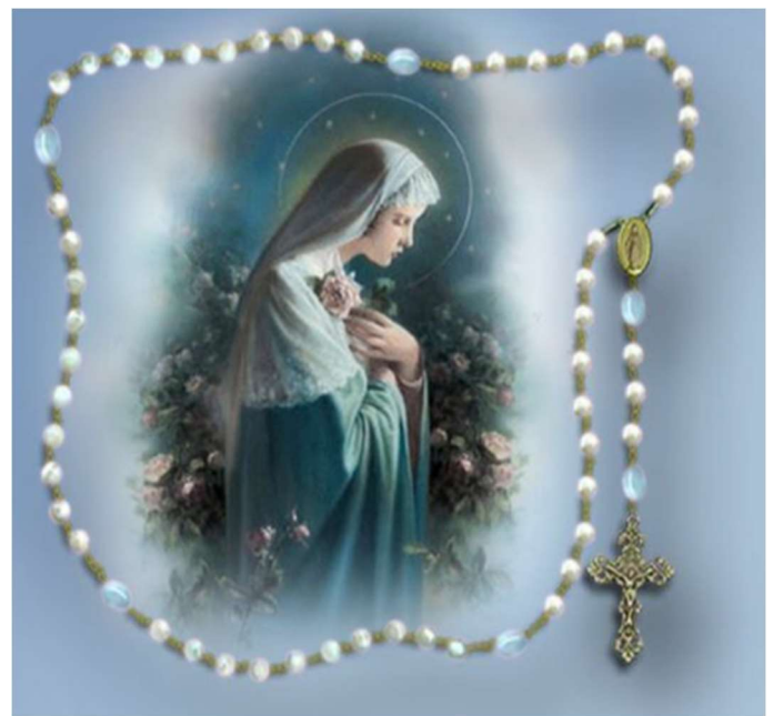
Pray the Rosary