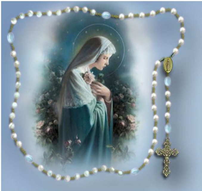
Pray the Rosary