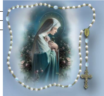
Pray the Rosary

We honor our council brothers who have preceded us in death by remembering the date that they went back home to the Lord. We also remember all our fallen members of the military this month that have given their lives for us to remain a free nation. The names of our deceased brothers are recognized on our Council Memorial Tower displayed in the parish Chapel.