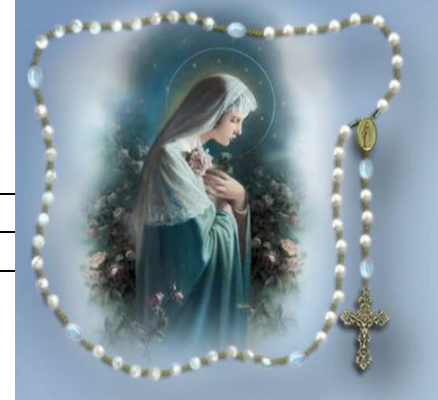
Pray the Rosary