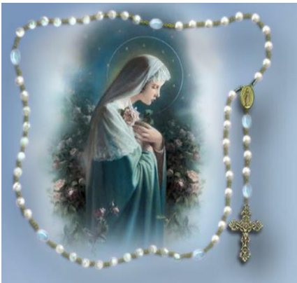
Pray the Rosary

Eternal rest grant unto them O Lord and let perpetual light shine upon them. May all our deceased brothers rest in peace. Amen.